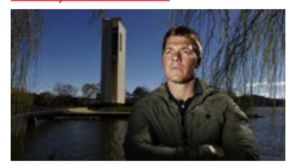
Clyde Rathbone www.clyderathbone.com

here is a certain purity to junior sport. Perhaps it's the fact that young amateurs are free of the ills which sometimes contaminate the echelons of professionalism. Wander down to a local school oval on any given weekend for a front row seat to sport at its finest — being played for the sheer joy that it brings its participants. These low-key events are about young people having fun with their mates. At this level, sport acts as a unique and invaluable vehicle through which kids are able to learn about life by challenging themselves.